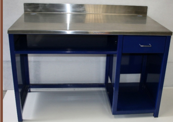
Standard Bench with Stainless Steel top and Slip Guard