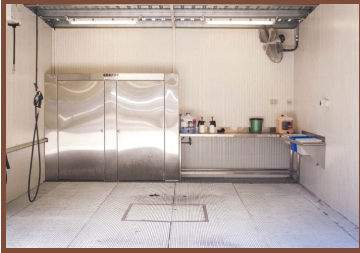
Wash Bay Storage Cabinet with Bunded Chemical Tray