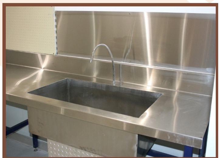
Standard Wash Basin with Splashback and surrounds

Eclipse Environmental is a Proud Australian Company with a passion for local manufacture and service delivery. With over 20 years experience in the Automotive Industry, Eclipse Environmental is focused on developing affordable, high quality and innovative solutions for dealerships and workshops alike.