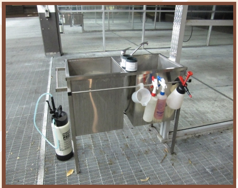
Car Wash Utility Trolley