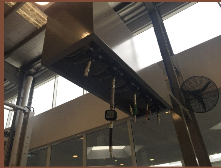
Oil Reel Cover