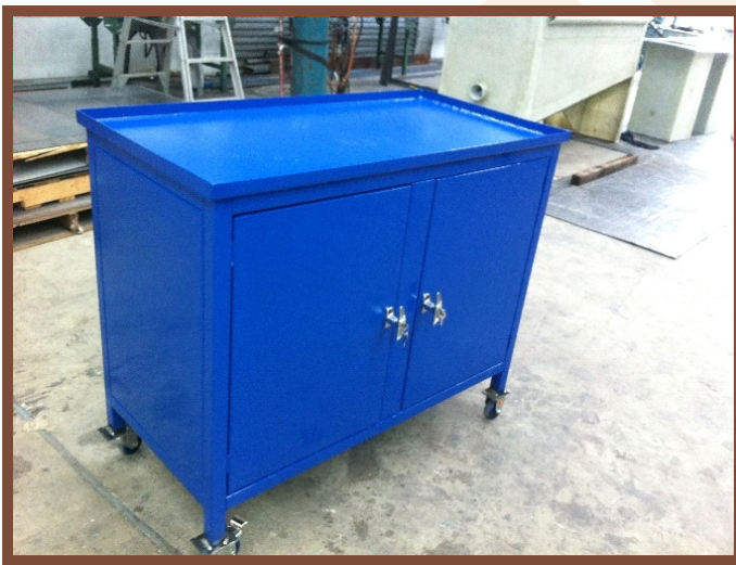
Standard Powder coated Bench