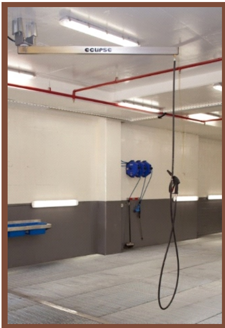
Wash Bay Boom Arm