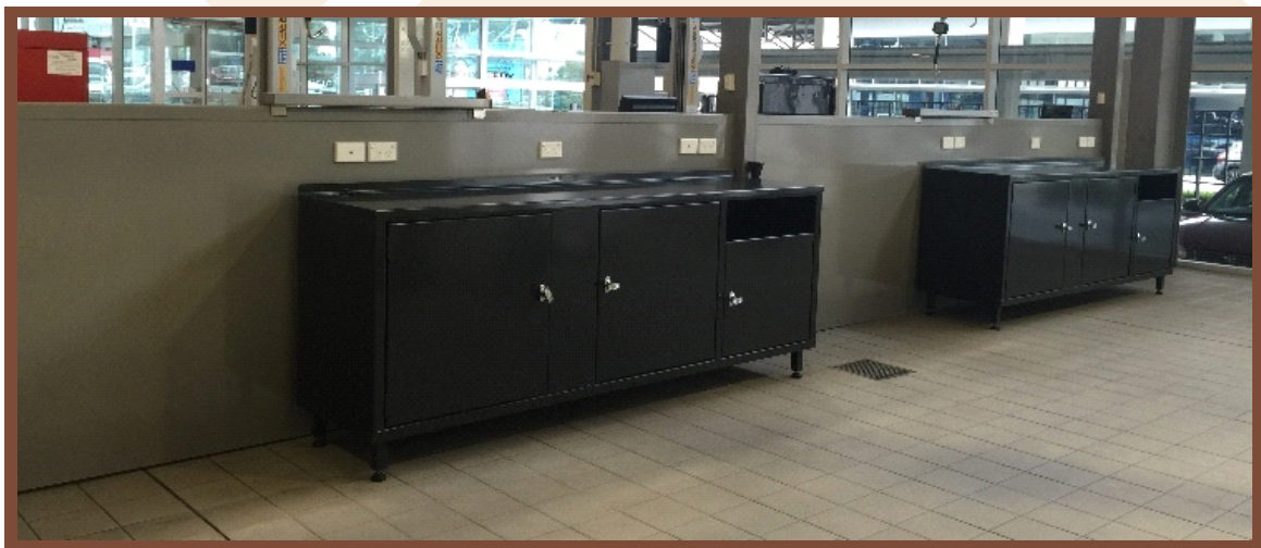
Bench with Built in Bin

Eclipse Environmental is a Proud Australian Company with a passion for local manufacture and service delivery. With over 20 years experience in the Automotive Industry, Eclipse Environmental is focused on developing affordable, high quality and innovative solutions for dealerships and workshops alike.