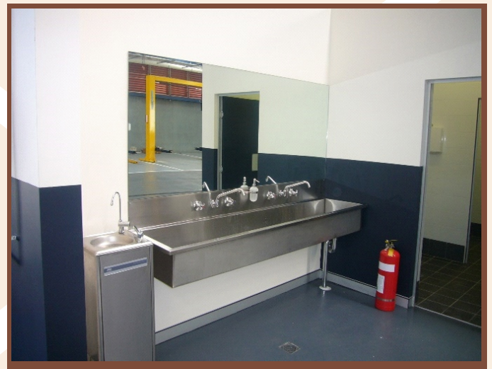
Wash Trough with taps and Mirror