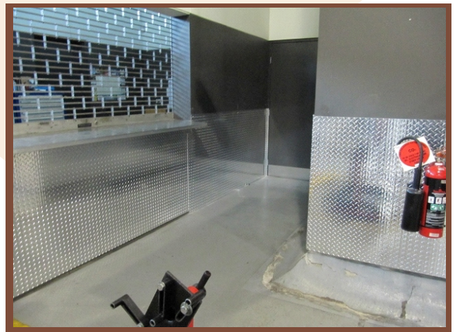
Checkerplate wall protection

Eclipse Environmental is a Proud Australian Company with a passion for local manufacture and service delivery. With over 20 years experience in the Automotive Industry, Eclipse Environmental is focused on developing affordable, high quality and innovative solutions for dealerships and workshops alike.