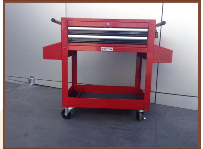
2 Draw mobile Trolley