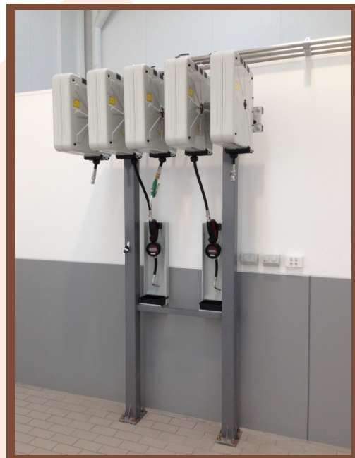
Gantry for Oil Reels