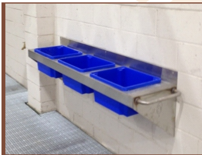
Wall Mounted Wash Bay Basin