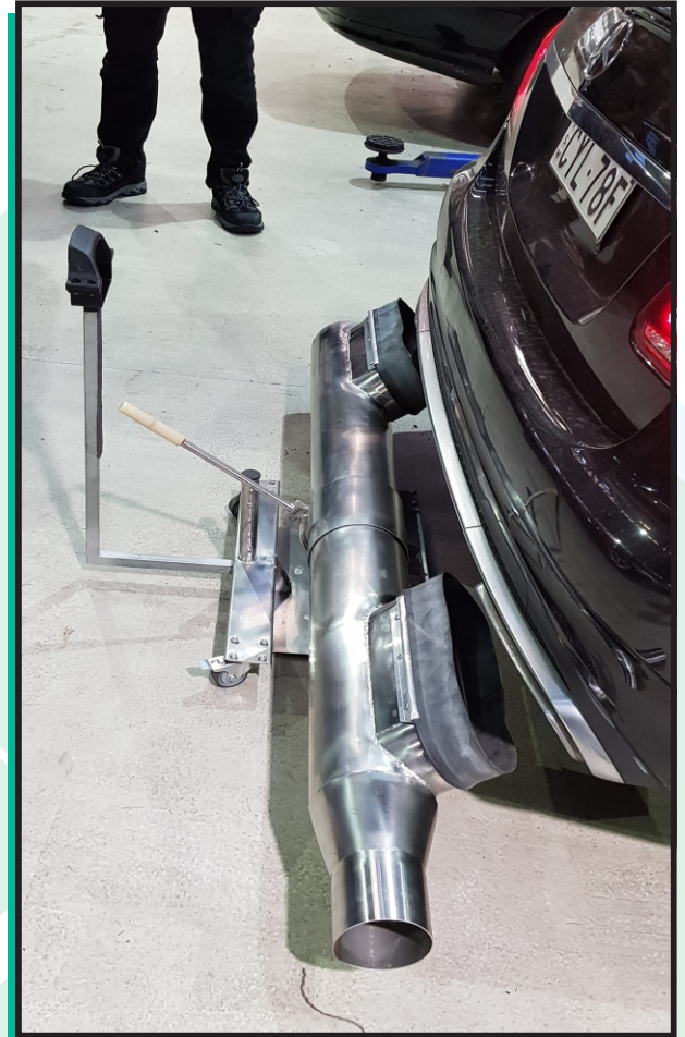
Non Contact dual exhaust adapter