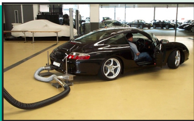
High Temperature silicon hose dual adapter

Eclipse Environmental is a Proud Australian Company with a passion for local manufacture and service delivery. With over 20 years experience in the Automotive Industry, Eclipse Environmental is focused on developing affordable, high quality and innovative solutions for dealerships and workshops alike.