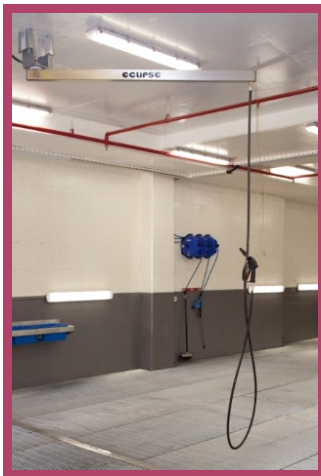
Rotating Boom Arm