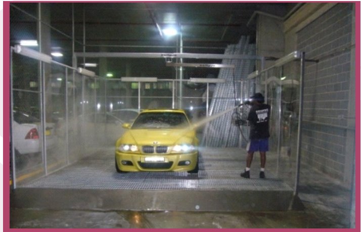
Self Contained Relocatable Wash Bay