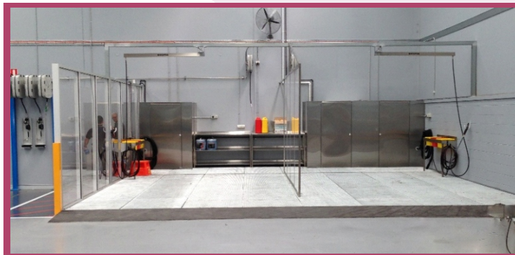
2 Bay Self Contained Wash Bay

Eclipse Environmental is a Proud Australian Company with a passion for local manufacture and service delivery. With over 20 years experience in the Automotive Industry, Eclipse Environmental is focused on developing affordable, high quality and innovative solutions for dealerships and workshops alike.