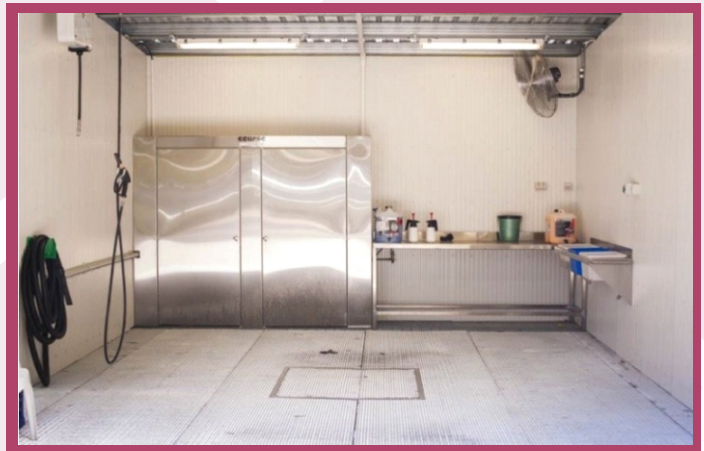
Self Contained Wash Bay