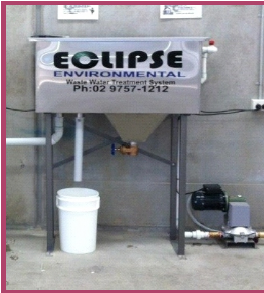
HYD1000 Oil/Water Separator