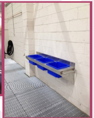
3 Tub Basin