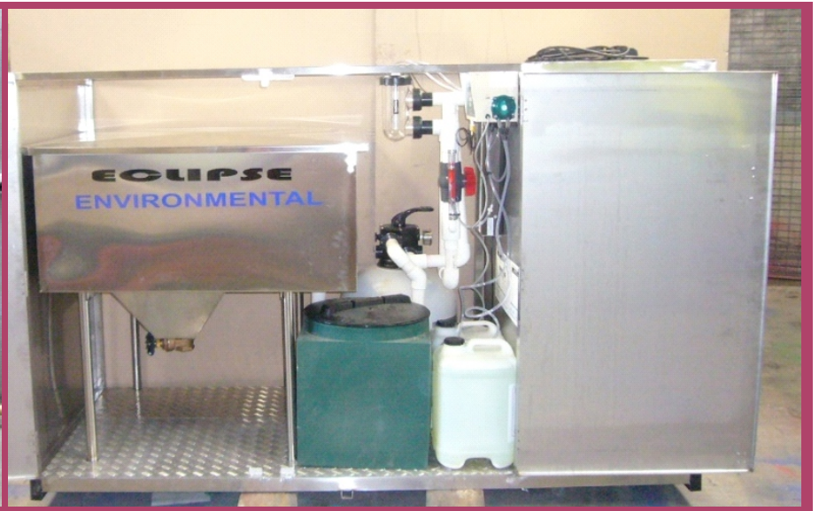
Nova 1 Self Contained Water Recycling System