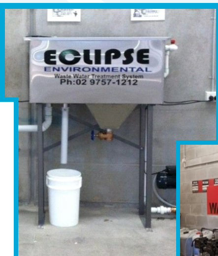
HYD1000 Oil/Water Separator