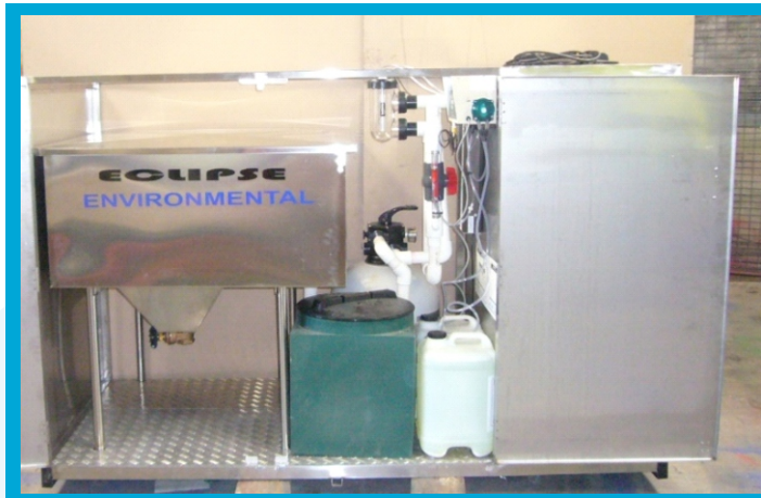
Nova 1 Self Contained Water Recycling System