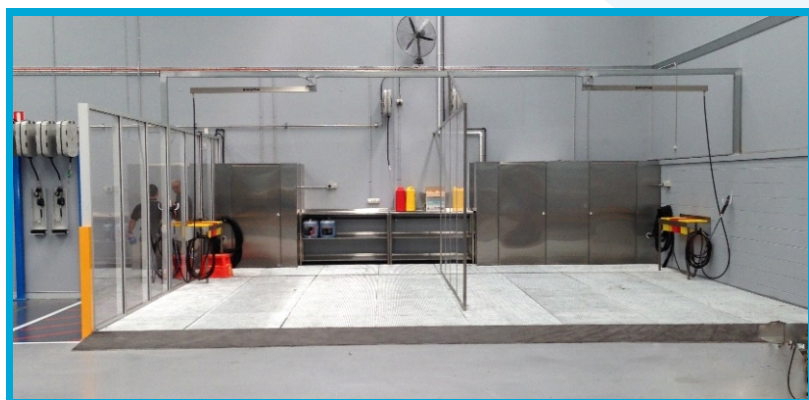
2 Bay Self Contained Wash Bay