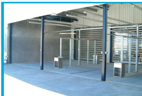
3 Bay Built in Wash Bay

Eclipse Environmental is a Proud Australian Company with a passion for local manufacture and service delivery. With over 20 years experience in the Automotive Industry, Eclipse Environmental is focused on developing affordable, high quality and innovative solutions for dealerships and workshops alike.